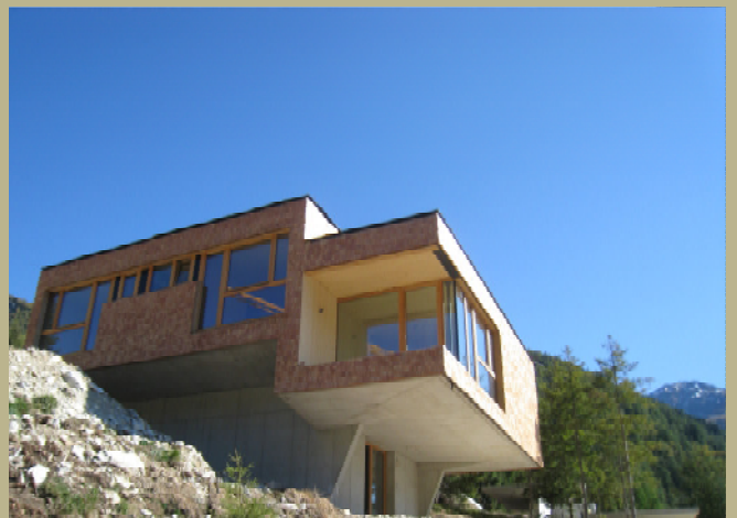
Haustyp II - Split